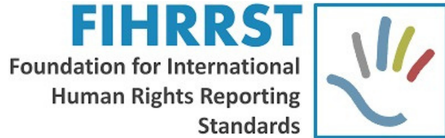
Foundation for International Human Rights Reporting Standards