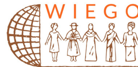
Women in Informal Employment: Globalizing and Organizing