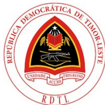
Ministry of Foreign Affairs and Cooperation of Timor-Leste