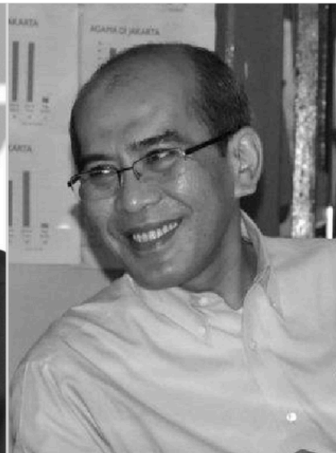
Faisal Basri Economist, Expert & Practitioner on The Politics of Economic Development