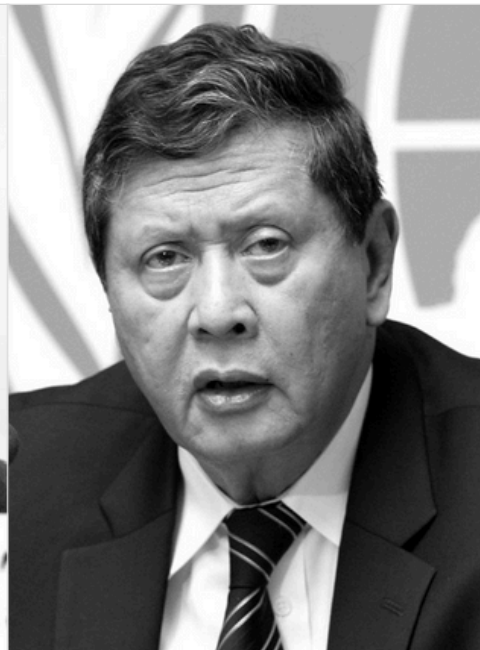
Marzuki Darusman Attorney General (1999-2001), Deputy Chair of National Commission on Human Rights (1993-1998), Special Rapporteur in United Nations