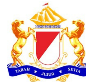
Kamar Dagang dan Industri Indonesia