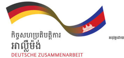
German Cooperation Cambodia